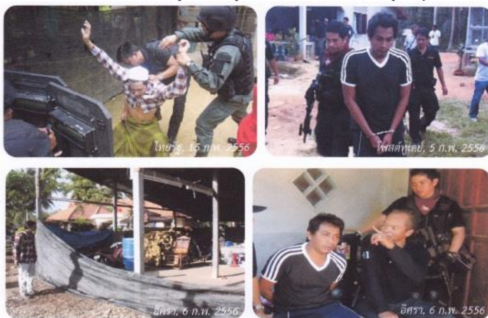
Illustration of the arrest of the accused by the mainstream media (two figures above) as compared to the alternative media. (two images below)

It is undeniable that with a low price and portability, radio is one of the most accessible media in the southern border area. The stations of community radio are found more than 50 stations in the southern border area to communicate with people in conflict areas (Titinop Komolnimiti, 2014) . Those radio stations that play a prominent role are the “Media Selatan” radio station (which produces its programs both in Thai and Malay languages to create a better understanding of the situation in the area), the “Bicara Patani” radio station (with its main objective to talk about what all that the Pattani people want), the “We Voice” radio station (that tries to reflect the voices of Muslim women), the “Ta-arwul” radio station ( a community radio for Muslim world society”) and the “Suara kita” radio station ( that communicates with Muslims in Malay language for 24 hours a day) etc. All stations have gathered together to become the "Southern Neighborhood Radio Network" to spread the peace at different radio frequency wave.