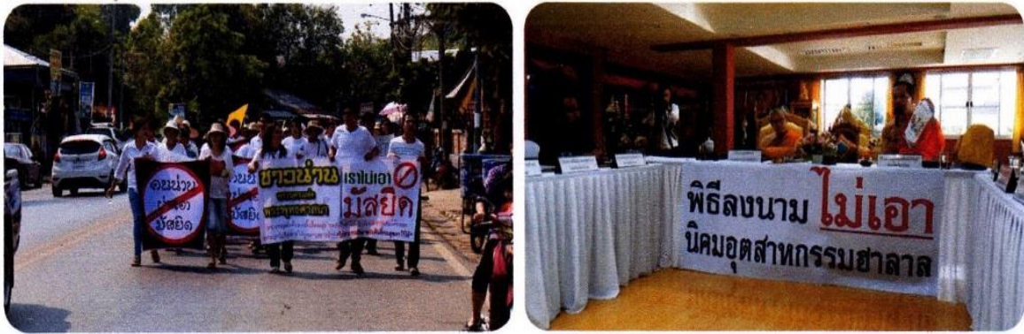
Pictures of demonstration protest against the construction of a mosque in Nan province in early 2015 (Left) and the objection to the Halal Food Industrial Estate project in Chiang Mai in mid-2016 (Right).