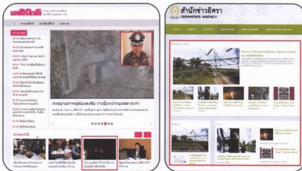
The space for news presentation on the Southern border provinces in “the Daily News website” (red bottom right) vs. “the Isra news website” (Full red frame) on April 8, 2017.